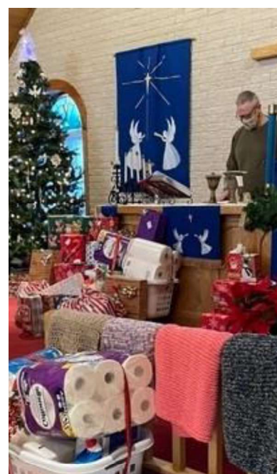
Blessing the Shawls