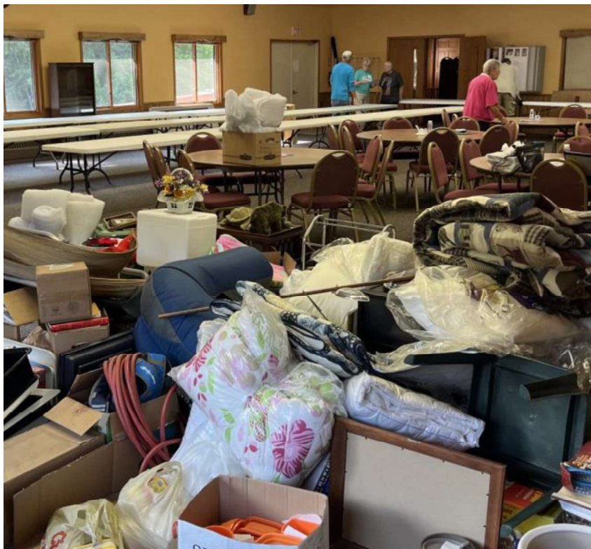
What event will we be preparing for?