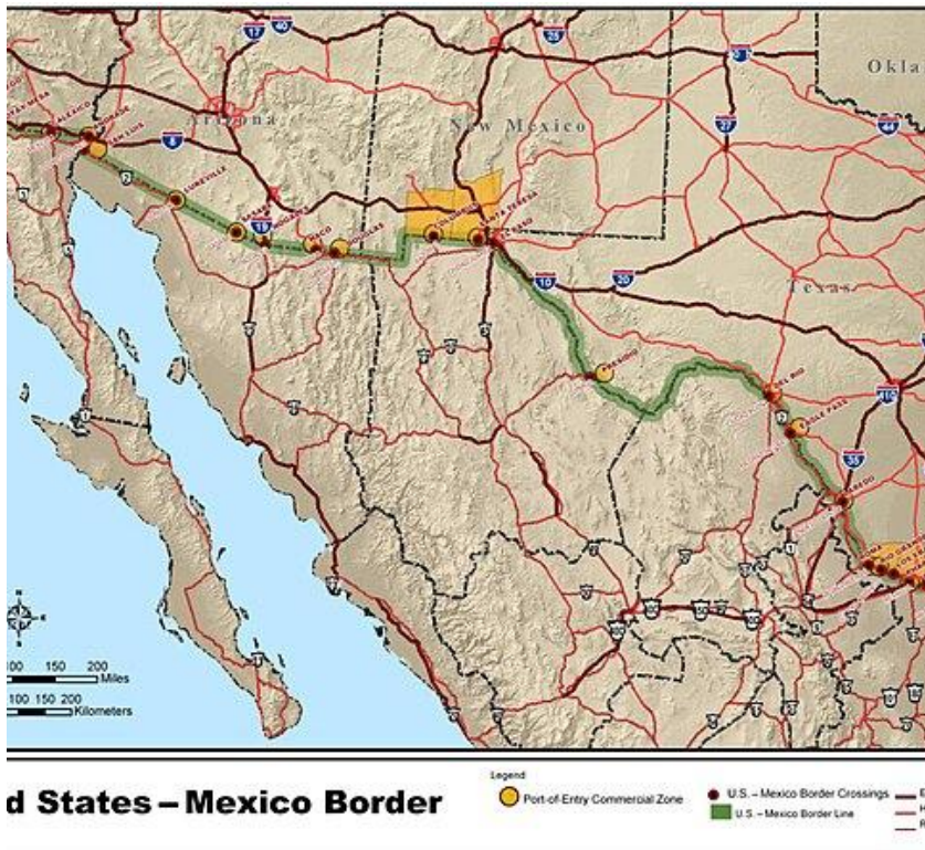
United States - Mexico Border